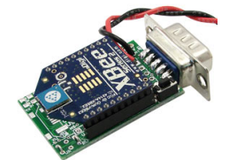
Shown with XBee Module