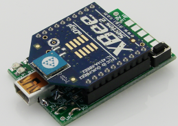
Shown with XBee Module